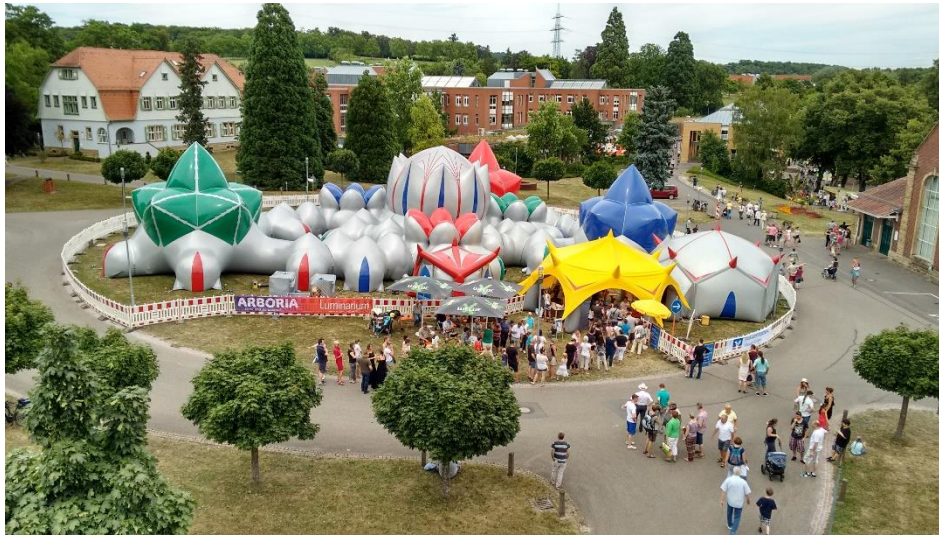
An aerial view of ARBORIA , a luminaria designed by Architects of Air

Each dome bears its own stylish leaf motif with the central 10 metre high dome an interpretation of the tall, Gothic windows and arching columns of York Minster in the United Kingdom. A creation that draws its inspiration from earthly things of beauty, ARBORIA has been designed by Alan Parkinson of internationally acclaimed Architects of Air and is one of many 'luminaria' they have created. Generating a sense of wonder and enchantment, visitors will enjoy a magical, sensory experience as they wander through this incredible airy castle. And it's important to note that this is the only time ARBORIA will be seen in Melbourne. It has to be seen to be believed!